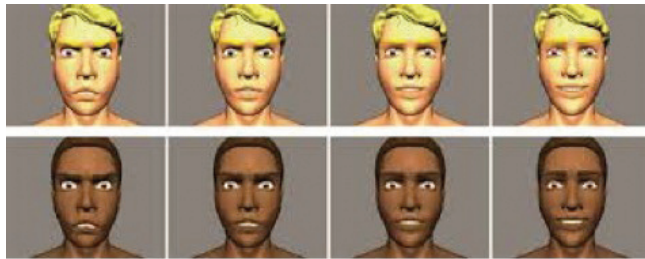
FIGURE 1. SAMPLE FACIAL EXPRESSION TEST

This behavior ranges from perceiving facial expressions differently to offering job callbacks at different rates to seeing guns more quickly in relation to some racial groups relative to others. Specifically, in studies of facial expressions, whites with stronger implicit racial bias perceive black faces as angrier than whites with weaker levels of bias; similarly, those with stronger implicit bias are apt to consider an expression happy or neutral if displayed by a white person, but neutral or angry if displayed by a black person (Hugenberg & Bodenhausen, 2003).