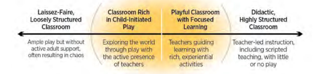
Figure 1. Early Childhood Instructional Continuum<sup>5</sup> The orange section depicts the "sweet spot" for maximum learning, trust and discovery.

In contrast to the balanced approach, studies suggest that teacher-directed classrooms can inhibit children's learning. For instance, when young children do not engage in dramatic play at school, behavioral challenges and expulsions increase.<sup>2</sup> Research has also shown that children - especially boys - in teacher-directed classrooms suffer more stress and are less motivated when compared to children in more child-initiated classrooms.3 At the other end of the spectrum, unstructured classrooms are also ineffectual. Indeed, research affirms that neither didactic techniques nor hands-off approaches work. As displayed in Figure 1, a high-quality early learning environment strikes a balance between child-initiated play in the presence of engaged teachers and focused experiential learning guided by teachers.4