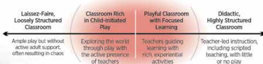
Figure 1. Early Childhood Instructional Continuum 10

parents to know about what their children are learning, what they enjoy, and what they have mastered. In short, the New York State Learning Standards' new and rigorous expectations for students' learning reinforce the need for strong collaboration between schools and families in support of children's learning.